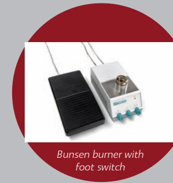
Bunsen burner with foot switch