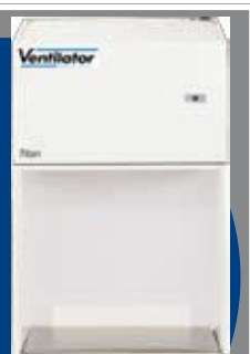
Easy prefilter exchange